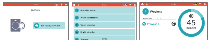
Approach, program and running cycle screen