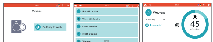
Approach, program and running cycle screen