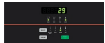
Quantum™ Standard Control